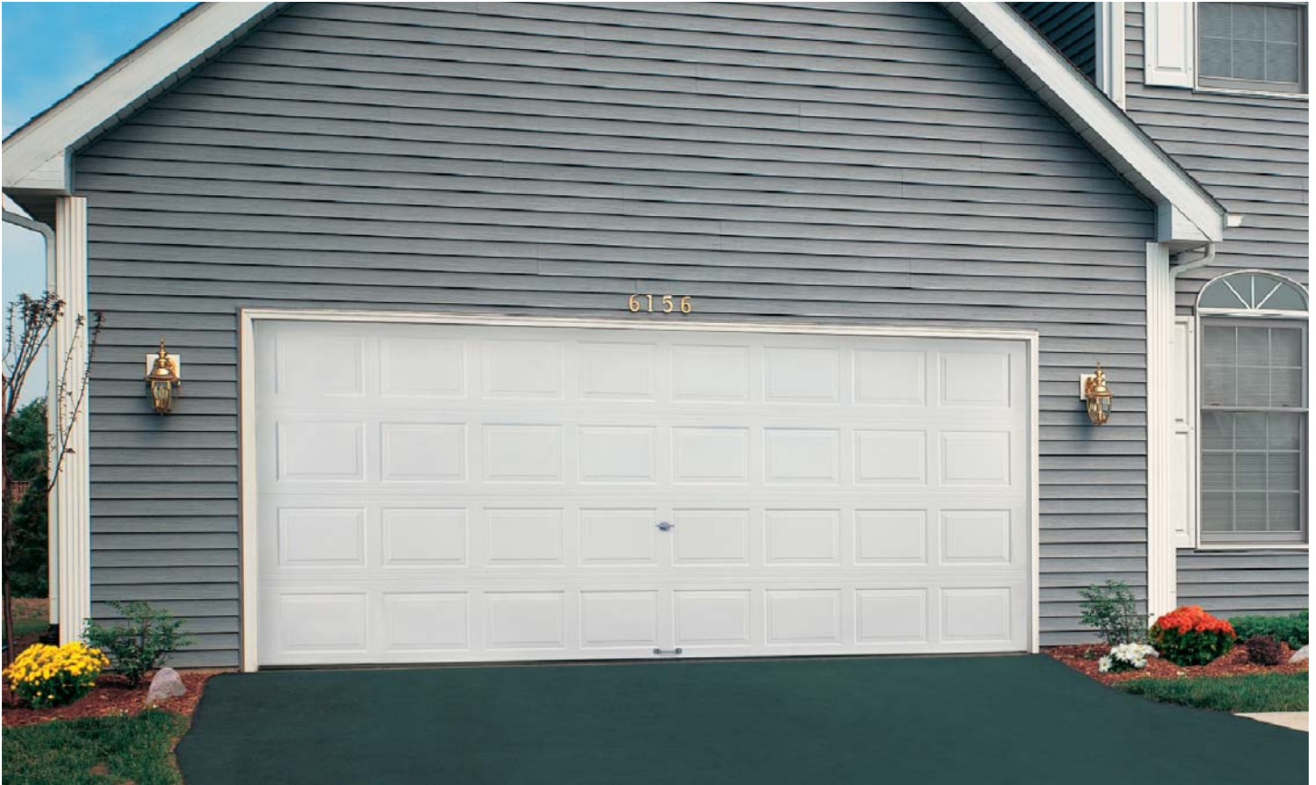
Model 8500 shown in Colonial design